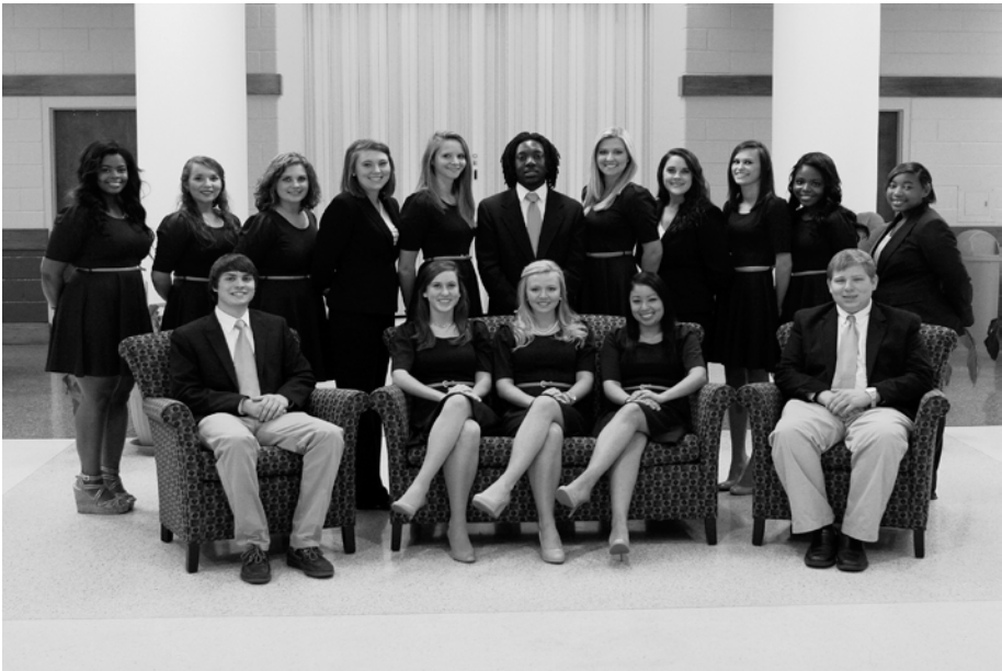
2014 Southern Union Ambassadors

Transitional courses (college preparatory) are offered in English, math and reading. These courses allow students to begin studying at their own level, to develop the skills and knowledge they will need to attempt credit-bearing courses. Descriptions of these courses: ENG 092, ENG 093, MTH 090, MTH 098, RDG 084 and RDG 085 appear in the "Course Description" section of this catalog. These courses produce institutional, non-transferable credit only and will not satisfy the requirements for degrees or certificates.