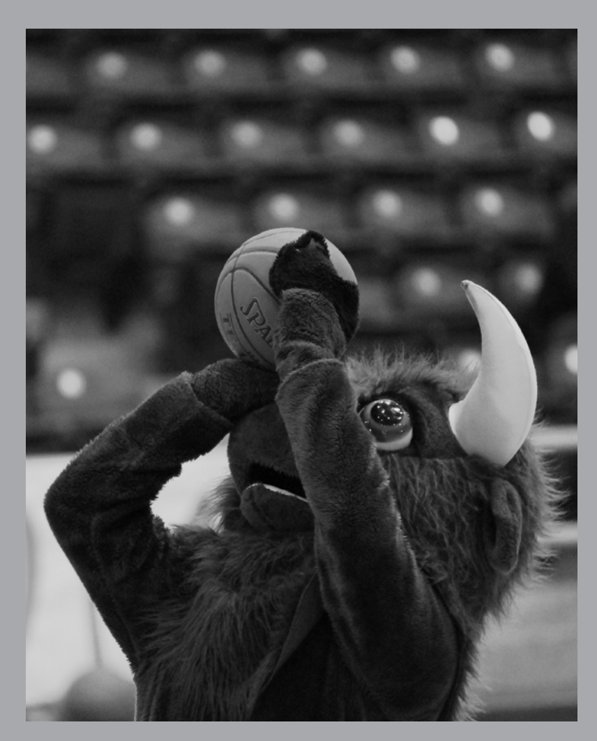
SUSCC Mascot "Battle the Bison"